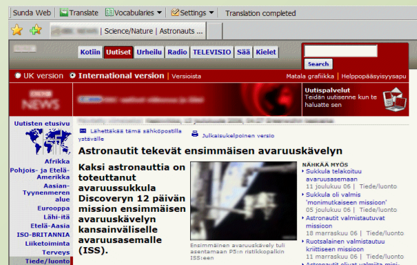
Sunda Web translates English web pages into Finnish while preserving the original page layout *

Operating system: Windows 2000/XP/Vista/7, Mac, Linux Web browser: Internet Explorer 6 or later, Mozilla Firefox